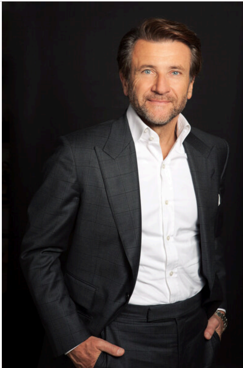
Robert Herjavec Headshot