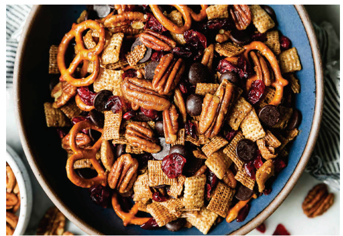
Pecan Snack Mix with Cranberries and Chocolate

Cool mix completely then stir in cranberries and dark chocolate chips.