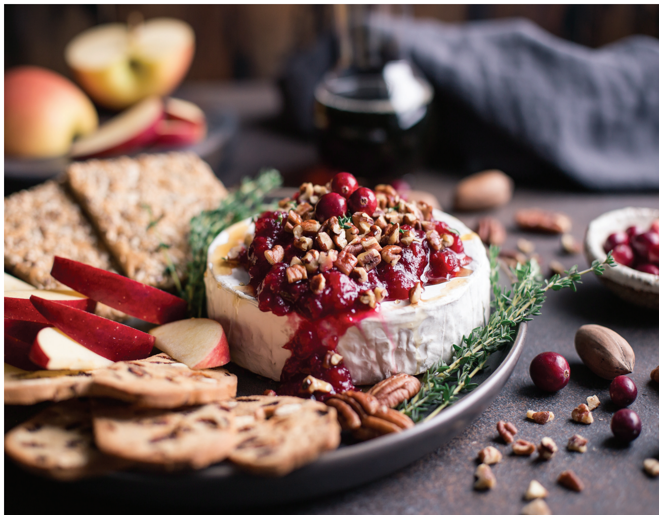
Baked Brie with Pecans and Cranberry Orange Chutney