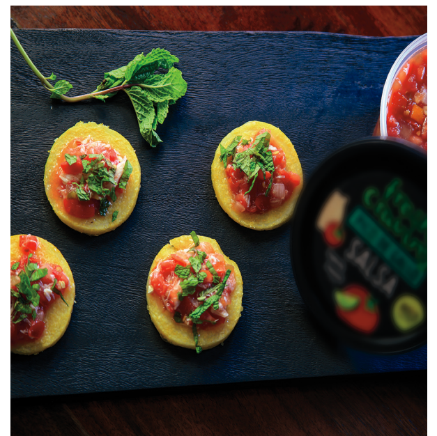
Polenta Rounds with Pico de Gallo Salsa and Crab

Pair with deeper, savory and earthy rosé.