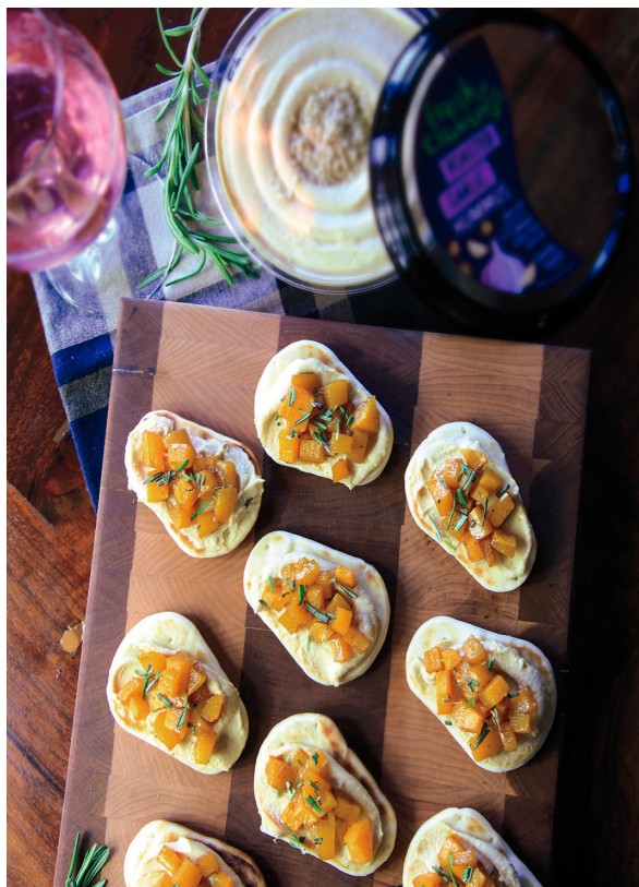
Spiced Butternut Squash Naan Flatbreads