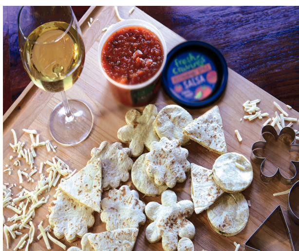
Cheesy Tortilla Cutouts with Salsa

Garnish with finely chopped fresh mint and pair with vibrant, fruity rosé.