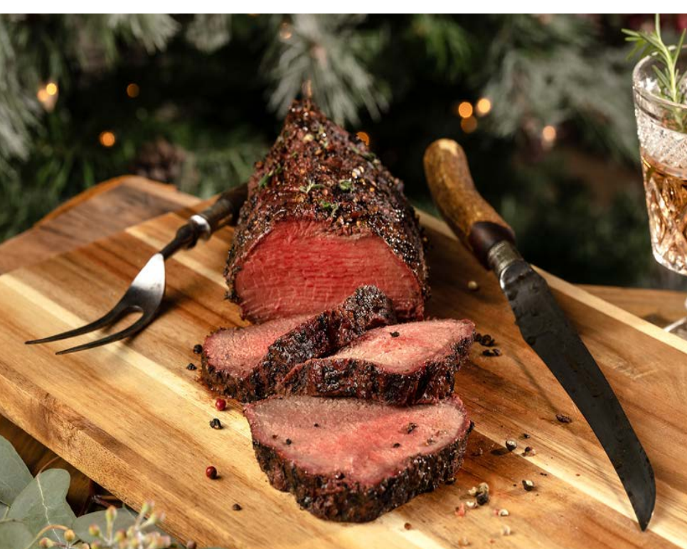
Top Sirloin Roast with Herb Garlic Peppercorn Crust