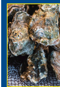
OYSTERS 50 CT - $39.99

Bring a large cooler or cardboard box to put your bags of fish in. A 48 qt. cooler will hold two bags of fish. Our special heavy weight fish bags are $1 each. You will pay at the store on fish day. Be on time! The driver will only be there for 30 minutes!