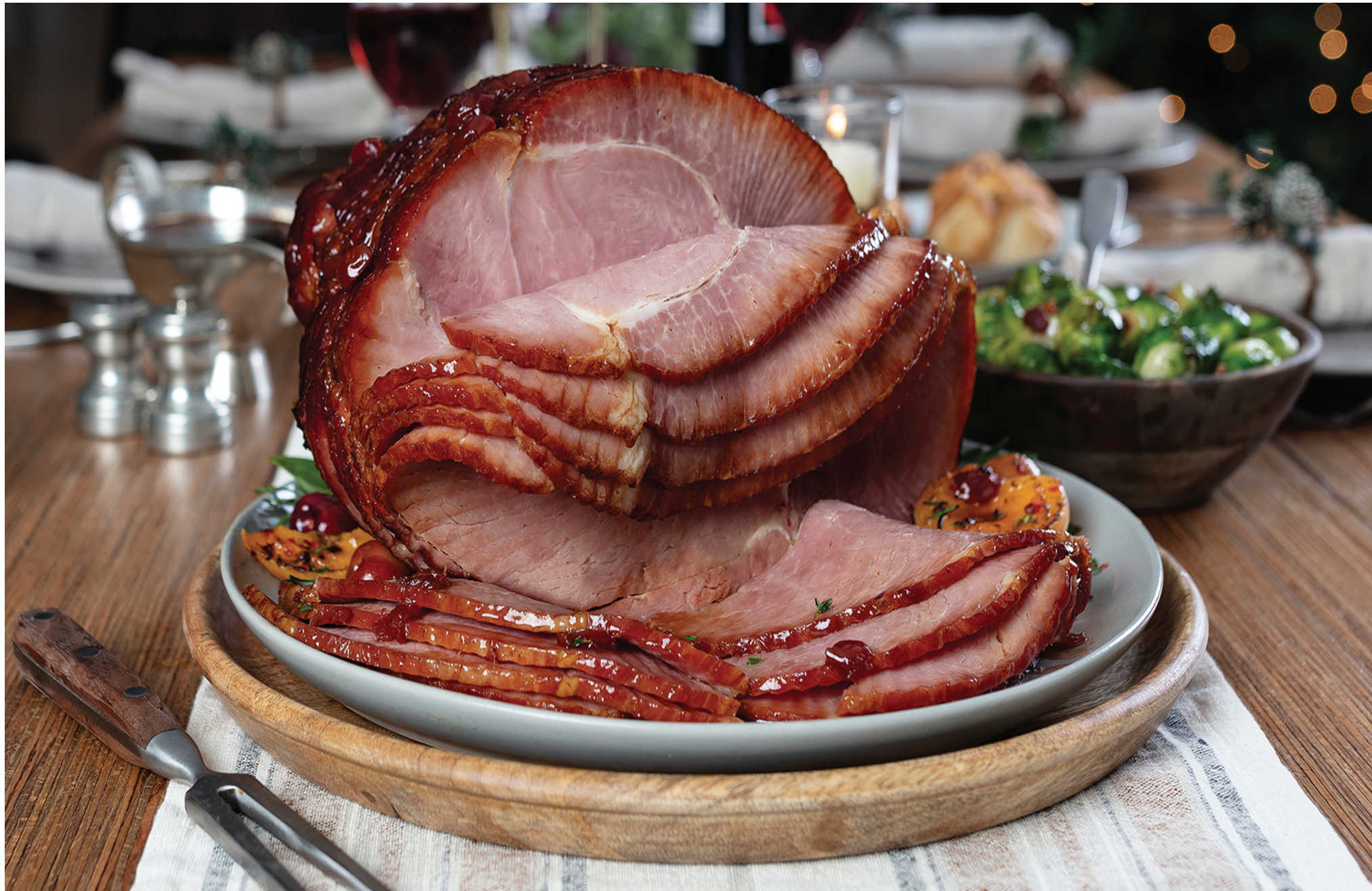
Rum and Cola Holiday Ham