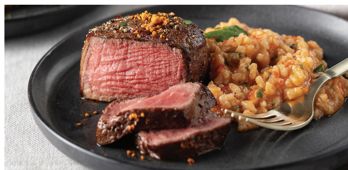
Suya-Dusted Filet Mignon with "Red Rice" Risotto

Rest filets 7-8 minutes. Serve over "red rice" risotto and sprinkle suya dust over filets.