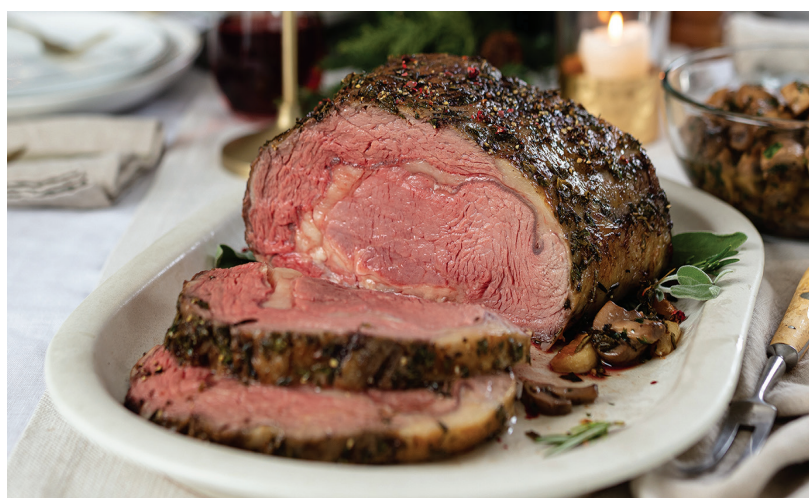
Dijon-Herb Prime Rib Roast with Garlic Butter Mushrooms

During last 15 minutes of cooking, glaze ham every 5 minutes.