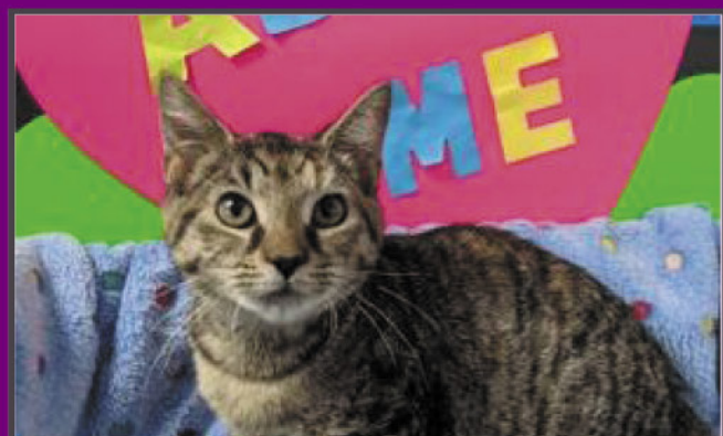
Little One (F) CORBETT BUILDING SUPPLY COMPANY 513 S. Memorial Avenue 843-549-5311