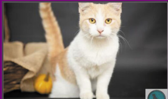
Fanta (M) SAPP LAW FIRM 125 S. Jefferies Boulevard 843-549-5923