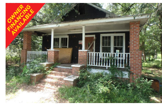
Awesome rehab opportunity for an investor. Owner financing now available. 1,470 SqFt on a great corner lot. A lot of potential with this deal!

*Not responsible for typographical errors 342 S. Jefferies Blvd • Walterboro • 843-549-7100 www.coldwellbankerrealestate.com | www.tlandagency.com