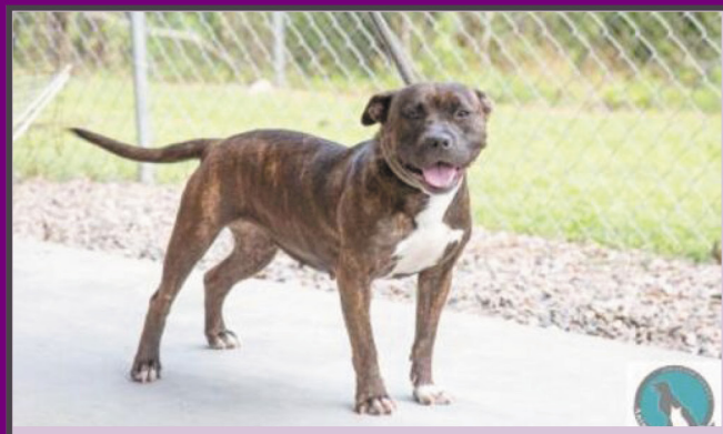
Paisley (F) CORBETT BUILDING SUPPLY COMPANY 513 S. Memorial Avenue 843-549-5311