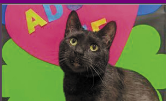
Boobadoo (M) THE PRESS AND STANDARD 1025 Bells Highway 843-549-2586