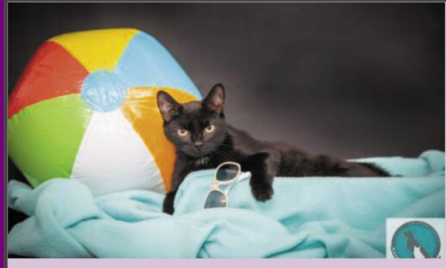
Magic (F) SAPP LAW FIRM 125 S. Jefferies Boulevard 843-549-5923