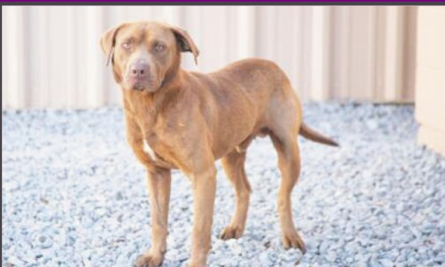
Maverick (M) THE PRESS AND STANDARD 1025 Bells Highway 843-549-2586