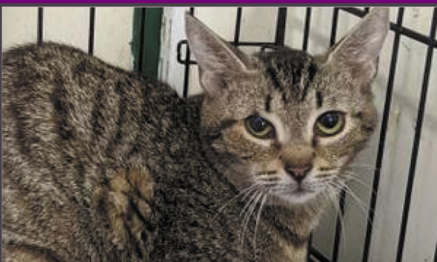
Barn Cat Mona (F) A BEAU POOL office: 843-835-3507 cell: 843-898-4135