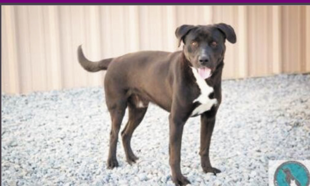
Gopher (M) TREASURE CHEST GOLD COMPANY 619 Bells Highway 843-549-2203