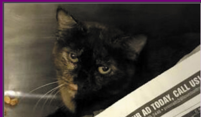
Belle (F) WALTERBORO ANIMAL HOSPITAL 113 Elizabeth Street 843-549-5645