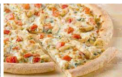
FRESH SPINACH AND TOMATO ALFREDO