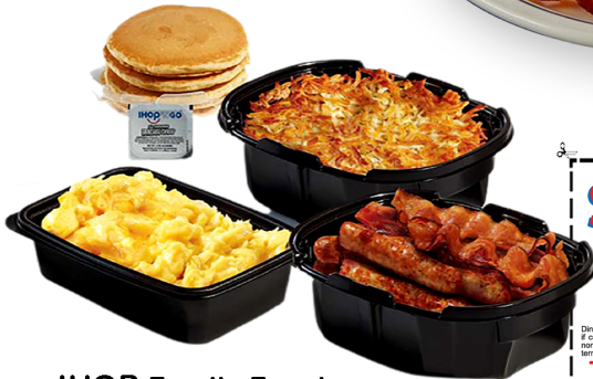
IHOP Family Feasts