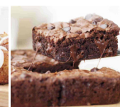
DOUBLE CHOCOLATE CHIP BROWNIE