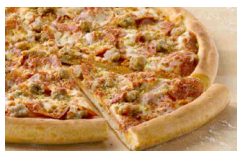
PEPPERONI, SAUSAGE & SIX CHEESE