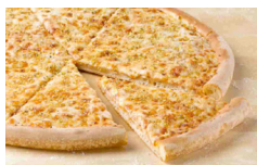
TUSCAN SIX CHEESE