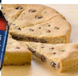
CHOCOLATE CHIP COOKIE

Philly Cheesesteak Meatball Pepperoni BBQ Chicken and Bacon Zesty Italian