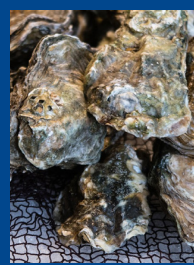
OYSTERS 50 CT - $36.99

104 Ivanhoe Drive - Walterboro Old BB&T Bank