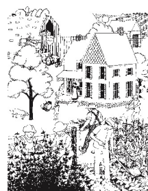
Agricultural Real Property