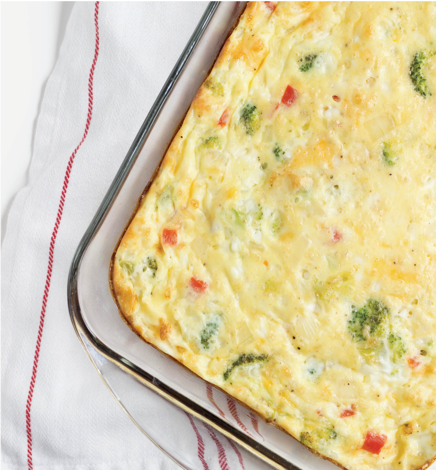
Veggie Egg Casserole