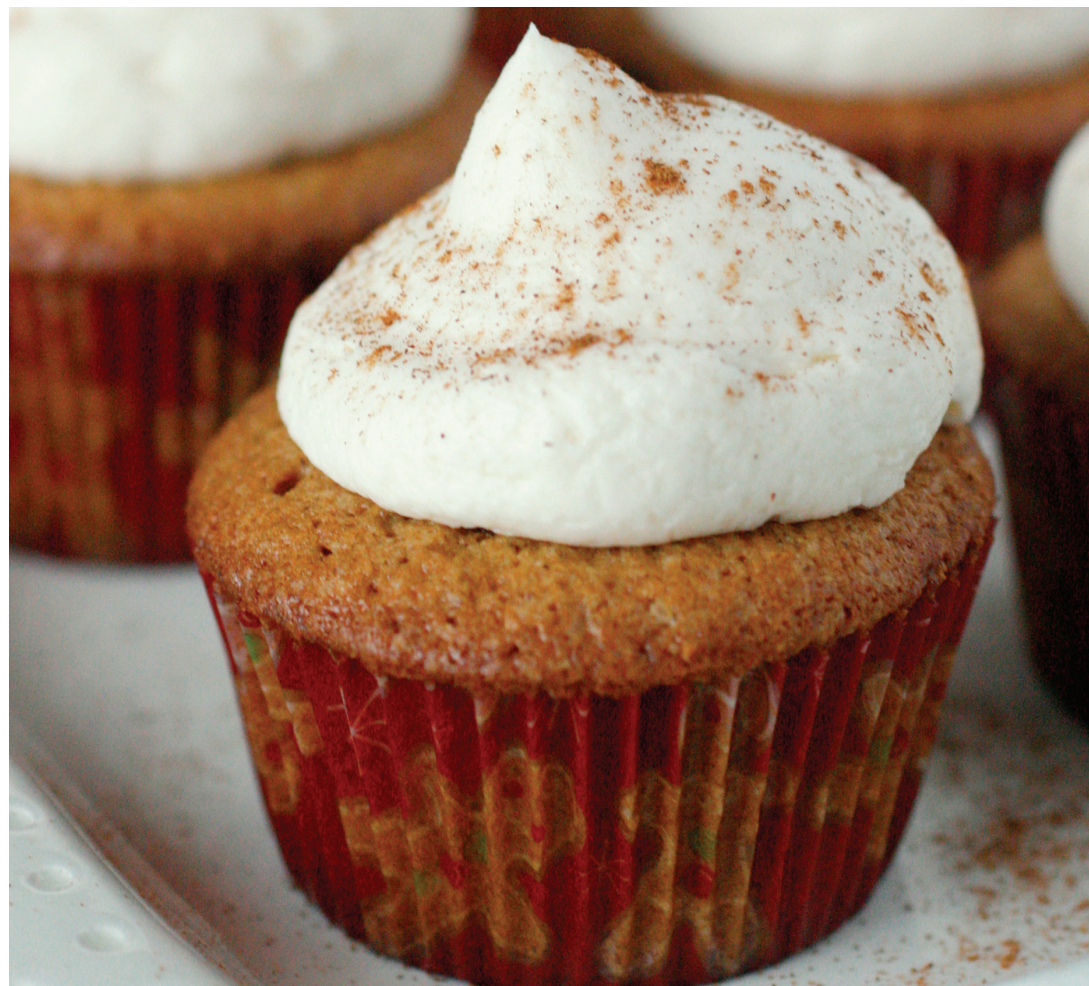
Gingerbread Cupcakes with Whipped Vanilla Buttercream