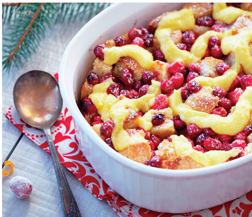
Cranberry Orange Bread Pudding

Serve bread pudding with warm custard sauce over top.