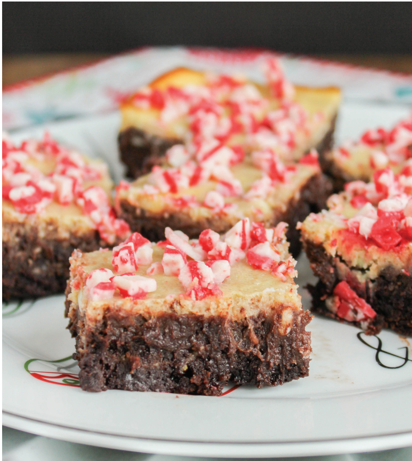
Peppermint Cheesecake Brownies

Sprinkle top of brownies with peppermint baking pieces and bake 10 minutes until brownies are set. Cool brownies completely in pan on wire rack before cutting into 16 squares.