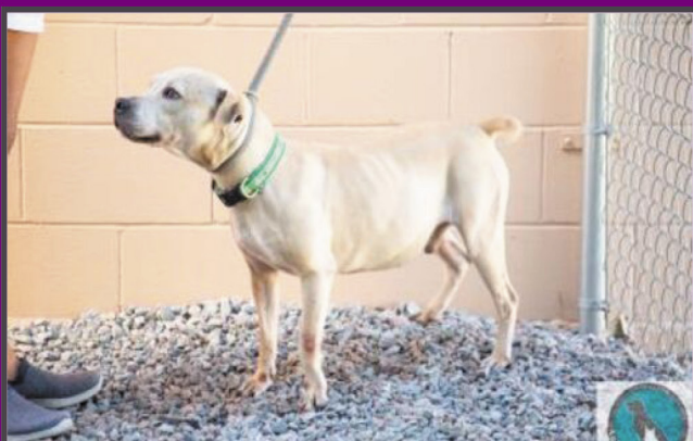
Saber (M) TREASURE CHEST GOLD COMPANY 619 Bells Highway 843-549-2203