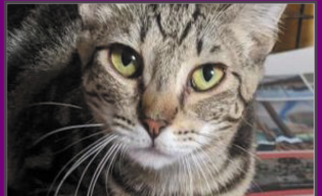
Cersei (F) STEEDLEY FENCE, LLC 288 Mt. Carmel Road 843-538-3655