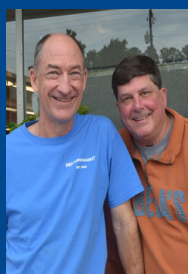
COME SEE PHIL & JAMIE FOR FRESH LOCAL SEAFOOD SPECIALS!