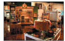
Explore Lowcountry History in our Museum

506 East Washington St. | Walterboro | 843-549-2303