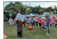
Family Friendly Events & Live Entertainment