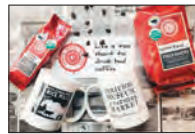
Café & Craft Shop with Delicious Food