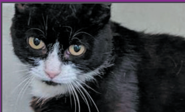
Choji (F) SAPP LAW FIRM 125 S. Jefferies Boulevard 843-549-5923