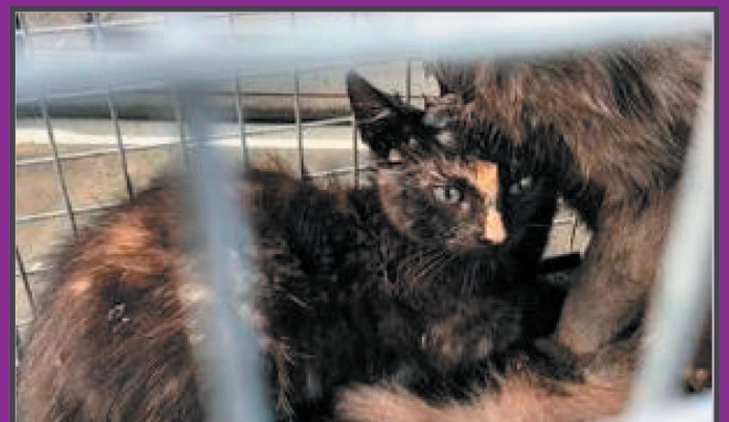
Shine (F) WALTERBORO ANIMAL HOSPITAL 113 Elizabeth Street 843-549-5645