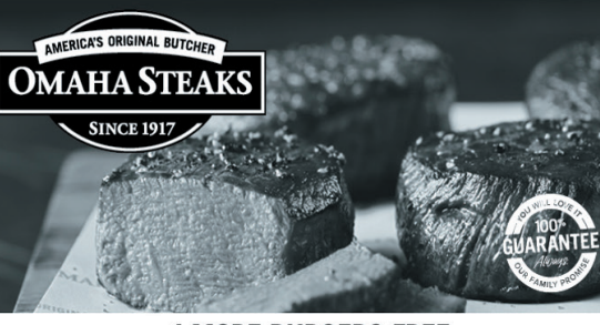
+ 4 MORE BURGERS FREE