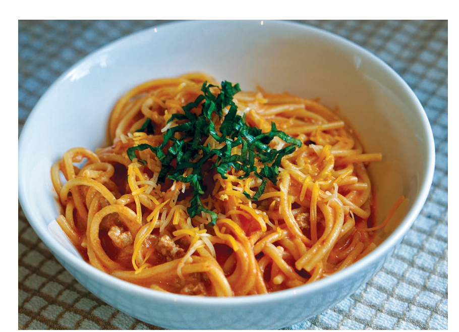
Creamy One-Pot Spaghetti

Stir spaghetti mixture. Stir in cream cheese and 1 cup cheddar cheese until melted. Ladle into bowls to serve. Sprinkle with remaining cheddar cheese. Garnish with chopped fresh basil or parsley, if desired.