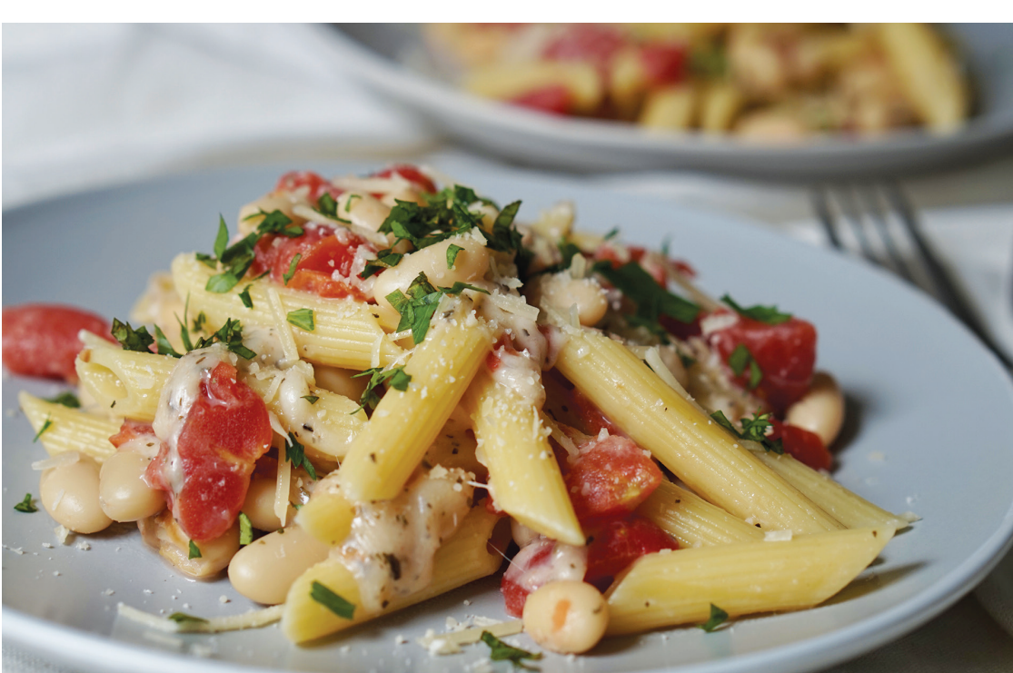
Pasta in a Pinch