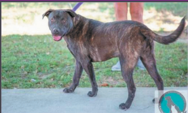
Lincoln (M) TREASURE CHEST GOLD COMPANY 619 Bells Highway 843-549-2203