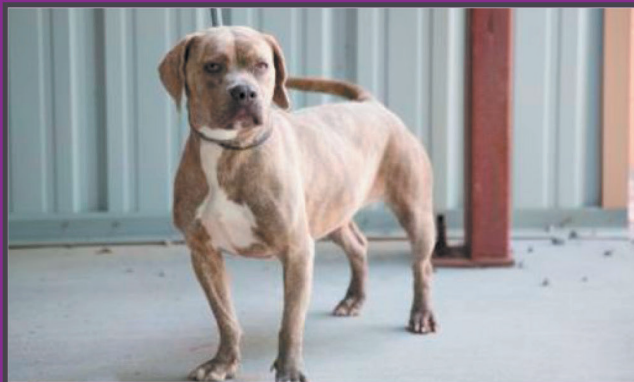
Kalhua (F) SAPP LAW FIRM 125 S. Jefferies Boulevard 843-549-5923