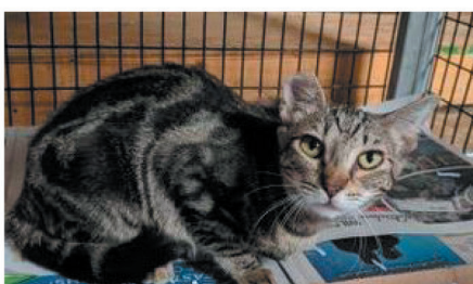
Barn Cat Cersei (F)

This program is sponsored by FoCCAS, Coastal Pain Care, and the Hilton Head Humane Association's Lowcountry Spay Neuter Clinic (SNAC) in Ridgeland.