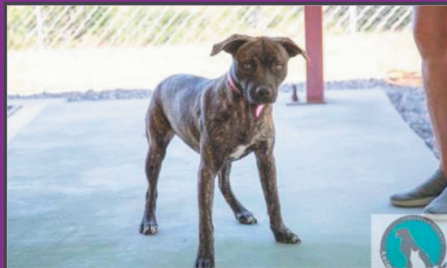
Lola (F) WALTERBORO ANIMAL HOSPITAL 113 Elizabeth Street 843-549-5645