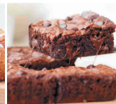
DOUBLE CHOCOLATE CHIP BROWNIE