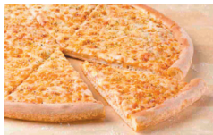
TUSCAN SIX CHEESE