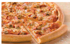
PEPPERONI, SAUSAGE & SIX CHEESE