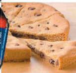
CHOCOLATE CHIP COOKIE