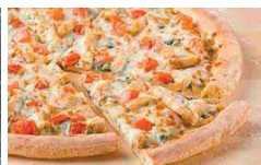
FRESH SPINACH AND TOMATO ALFREDO