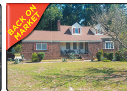
148 WINTERGREEN ROAD

Very well maintained mobile home located just outside of town in Lafayette Park subdivision. New metal roof, All new doors & windows throughout. Renovated with a cozy, cabin feel. two full baths, dining room with a fireplace, two Custom cabinets in kitchen. Open floor plan family rooms and much more! A motivated seller. with 3 bedrooms & 2 baths. Master bedroom has new carpet. Master bath has large garden tub, stand up shower and a double vanity. Sheds & carport will convey. *Very motivated seller. $135,500