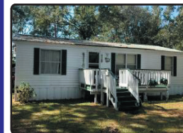
221 LAFAYETTE LANE

This property is located near the old Railway line running through Walterboro. This is the old Rhodes Oil and SCV Oil facility. Office space, storage closet, bulk plant, storage tanks and loading dock. Conveniently located off of Jefferies Boulevard on Moore Street. The office has 2,407 square feet of usable office space with counters, desks and office equipment and petroleum tanks. The bulk plant is just down the street. Seller is motivated $199,000