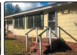
102 PANSY STREET

A beautiful, well maintained, two bedroom, two bath, mobile home with 0.7 lot located in Lafayette Mobile Home Park. All appliances in kitchen and the two work sheds and two car carports convey. $70,000