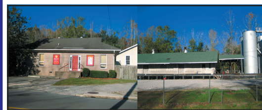
305 MOORE STREET

This property is located near the old Railway line running through Walterboro. This is the old Rhodes Oil and SCV Oil facility. Office space, storage closet, bulk plant, storage tanks and loading dock. Conveniently located off of Jefferies Boulevard on Moore Street. The office has 2,407 square feet of usable office space with counters, desks and office equipment and petroleum tanks. The bulk plant is just down the street. Seller is motivated $199,000