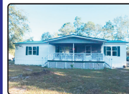
130 CALLOH DRIVE

Investor! First time home buyer! here is a 2 bedroom, 2 bath home with room there for 3rd bedroom. Family room with fireplace. Wood floors. Attic storage. Outside workshop. Close to town & schools. Call today $85,000