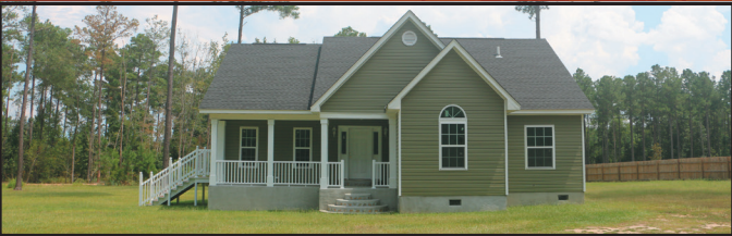
5360 JEFFERIES HIGHWAY - $215,000

Log home! Fireplace! Swimming pool! Walk out basement! Fishing pond and stream! 2 acres! Skylights! Small town! Cottageville!, only a short distance to Charleston and Summerville. Plenty of room for your family to enjoy! 3 bedroom, 2 bath with 2076 sq ft. Loft with skylight looks over great room. Master bedroom with en suite has 2 skylights & walk in closet. Wrap Around front porch. Easy access to attic for more storage. You are also close to the Edisto River. Call today!