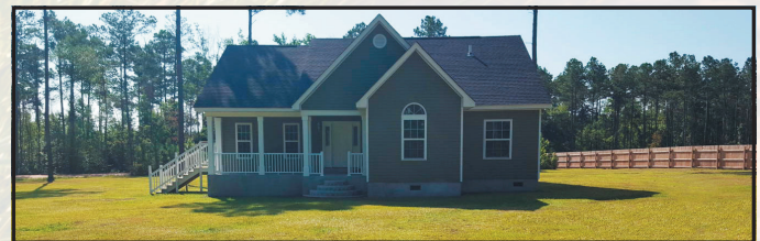
5360 JEFFERIES HIGHWAY - $229,900

Beautiful country home on 26.5 acres mostly wooded, with timber value, 3 bedrooms, 2 baths, fireplace, open kitchen great room area, front porch, out buildings, plenty of room for horses, small farm, great hunting area.