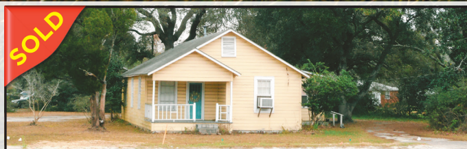
1374 BELLS HIGHWAY - $120,000

LOOK AT THIS NEW HOME!!!! Still making final touch ups. This three bedroom, two bathroom, and mudroom. House is 1500 sqft, with granite counter tops in the kitchen and bathrooms. Very nice open floor plan. A must see!