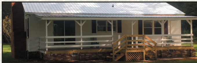
1617 GOODLAND ROAD - BRANCHVILLE - $237,500

73 acre country retreat. Fly in or drive in! Open pasture which has been used for a private air strip, merchantable timber, great hunting & wildlife. There is a 2 bedroom, 2 bath rustic lodge along with 2 quonset huts for hangar shed & 2 carports.