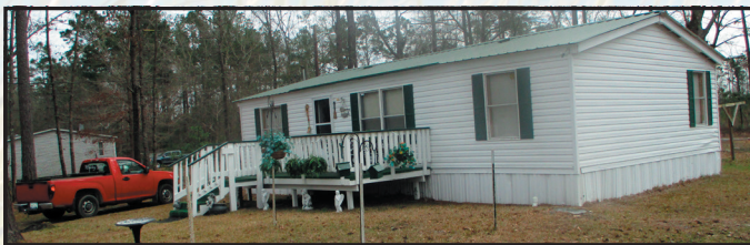
221 LAFAYETTE LANE - $77,000

A beautiful, well maintained, two bedroom, two bath, mobile home with 0.7 lot located in Lafayette Mobile Home Park. All appliances in kitchen and the two work sheds and two car carports convey.