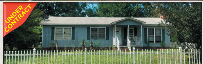
905 POPLAR STREET - $49,000

Location!! Location!! Great opportunity for own a home or investment property. The home needs some TLC, but has lots potential. It offers 1,299 square feet, living room, family room, eat-in kitchen, 2 bedrooms, 1 bath, and a sunroom. It is located close to area businesses, dining, schools, hospital and I-95 exit 57.