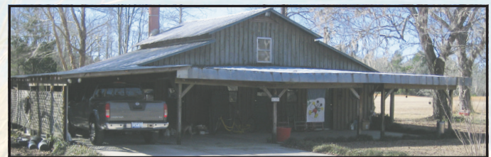
1323 CLATTY FARM ROAD - SMOAKS - $429,500

A beautiful, well maintained, two bedroom, two bath, mobile home with 0.7 lot located in Lafayette Mobile Home Park. All appliances in kitchen and the two work sheds and two car carports convey.