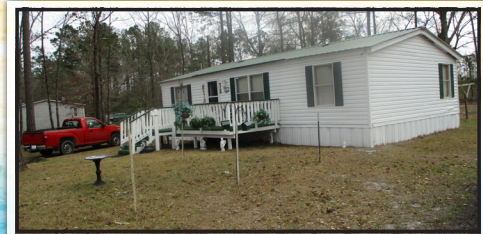
221 LAFAYETTE LANE - $77,000

Back to the small town life, quiet neighborhood away from big city congestion, 3 bedrooms, 2 baths, with a garage and storage building.