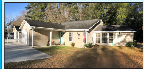
90/98 TAYLOR STREET - VARNVILLE - $168,000

This property is ready for you to make it your own and have a rental unit to help you pay the mortgage. There are 2 mobile homes on almost 12 acres!. The first home is a 3 bedroom, 2 bath home 1750 sqft. The second home is 2362 sqft 4 bedroom, 2 bath home. This parcel can be easily be divided if you want to sell one of the homes. Plenty of room for farm animals in a quiet setting.