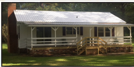
1617 GOODLAND ROAD - BRANCHVILLE - $237,500

Beautiful country home on 26.5 acres mostly wooded, with timber value, 3 bedrooms, 2 baths, fireplace, open kitchen great room area, front porch, out buildings, plenty of room for horses, small farm, great hunting area.