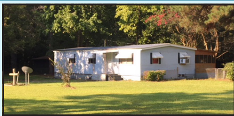
1223 HOMESTEAD DRIVE - LODGE - $78,500

A beautiful, well maintained, two bedroom, two bath, mobile home with 0.7 lot located in Lafayette Mobile Home Park. All appliances in kitchen and the two work sheds and two car carports convey.