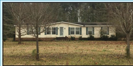
464 WESLEY CHAPEL ROAD - COTTAGEVILLE - $199,900

Beautiful 4.8 acre lot with a mobile home and storage shed/ barn. Enjoy the peace and quiet of country living in Lodge or purchase as an investment property.