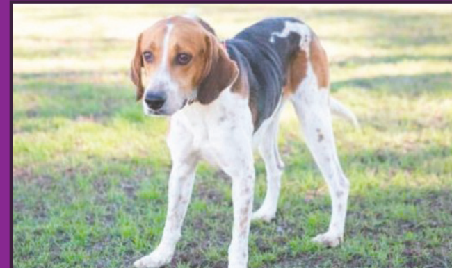
Spirit (M) CORBETT BUILDING SUPPLY COMPANY 513 S. Memorial Avenue 843-549-5311