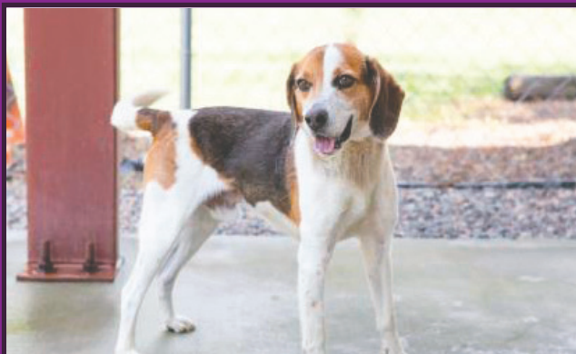
Ned (M) WALTERBORO ANIMAL HOSPITAL 113 Elizabeth Street 843-549-5645