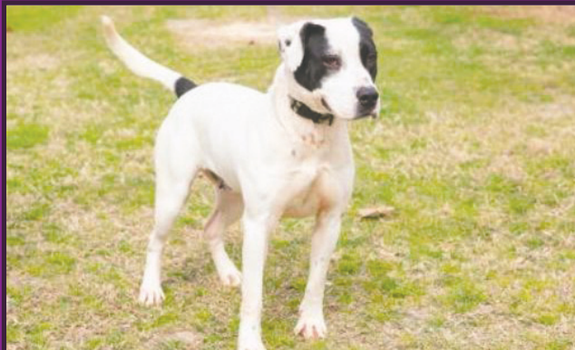
Saddie (F) CAROLINA PAWS 1182 Sniders Highway 843-538-4692