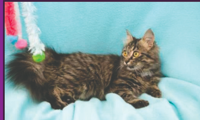
Petal (F) THRIFT MASTERS 1862 Jefferies Highway 843-635-4968