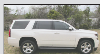
'15 CHEVROLET TAHOE $38,995