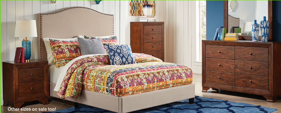
Other sizes on sale too!

SPECIAL OFFER YOUR CHOICE QUEEN UPHOLSTERED BED OR 5 PC GROUP