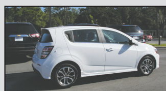
'17 CHEVROLET SONIC WAS - $17,995 NOW - $16,995