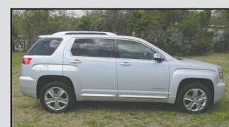
'17 CHEVROLET TERRAIN DENALI $27,995