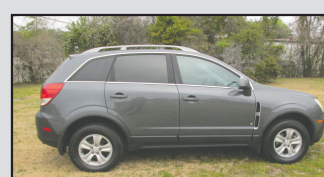
'08 SATURN VUE $7,995