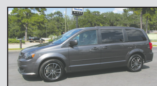
'17 DODGE CARAVAN WAS - $22,995 NOW - $21,995

351 N. Jefferies Blvd. • Walterboro, SC | 843-549-6363 | Parts - 843-549-6311 | Service - 843-549-6312