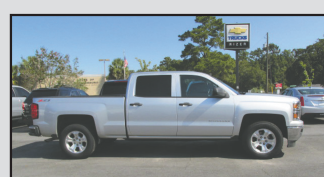
'14 CHEVROLET SILVERADO WAS - $28,995 NOW - $27,995