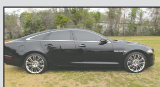
'12 JAGUAR XJ $26,995