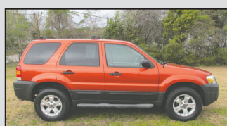
'07 FORD ESCAPE $7,995