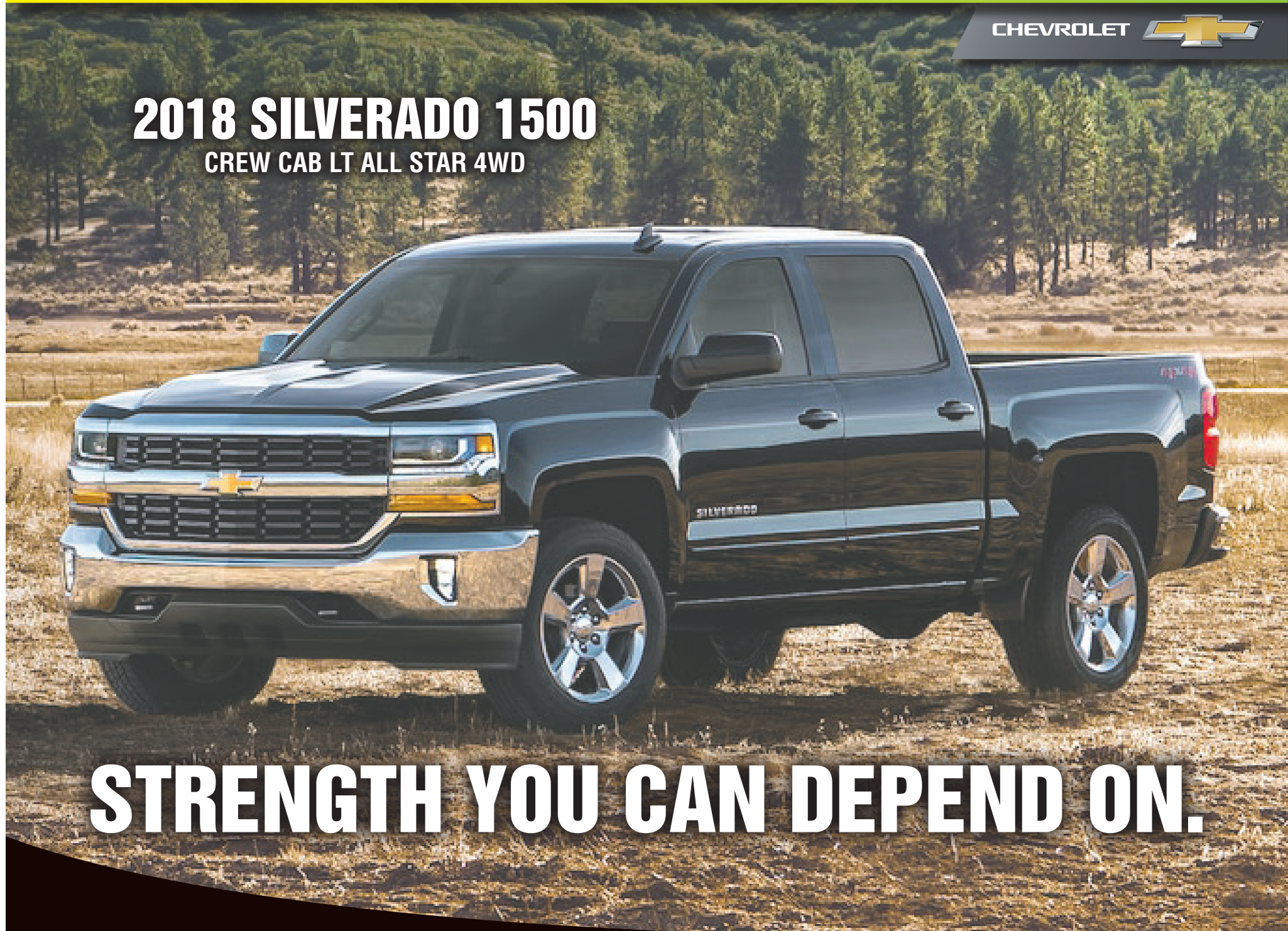
2018 SILVERADO 1500 CREW CAB LT ALL STAR 4WD