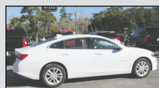
'17 CHEVROLET MALIBU $17,995