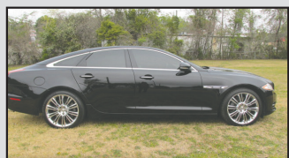
'12 JAGUAR XJ $26,995