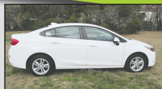
'17 CHEVROLET CRUZE $15,995