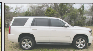
'15 CHEVROLET TAHOE $38,995