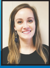
COME SEE ASHLEY