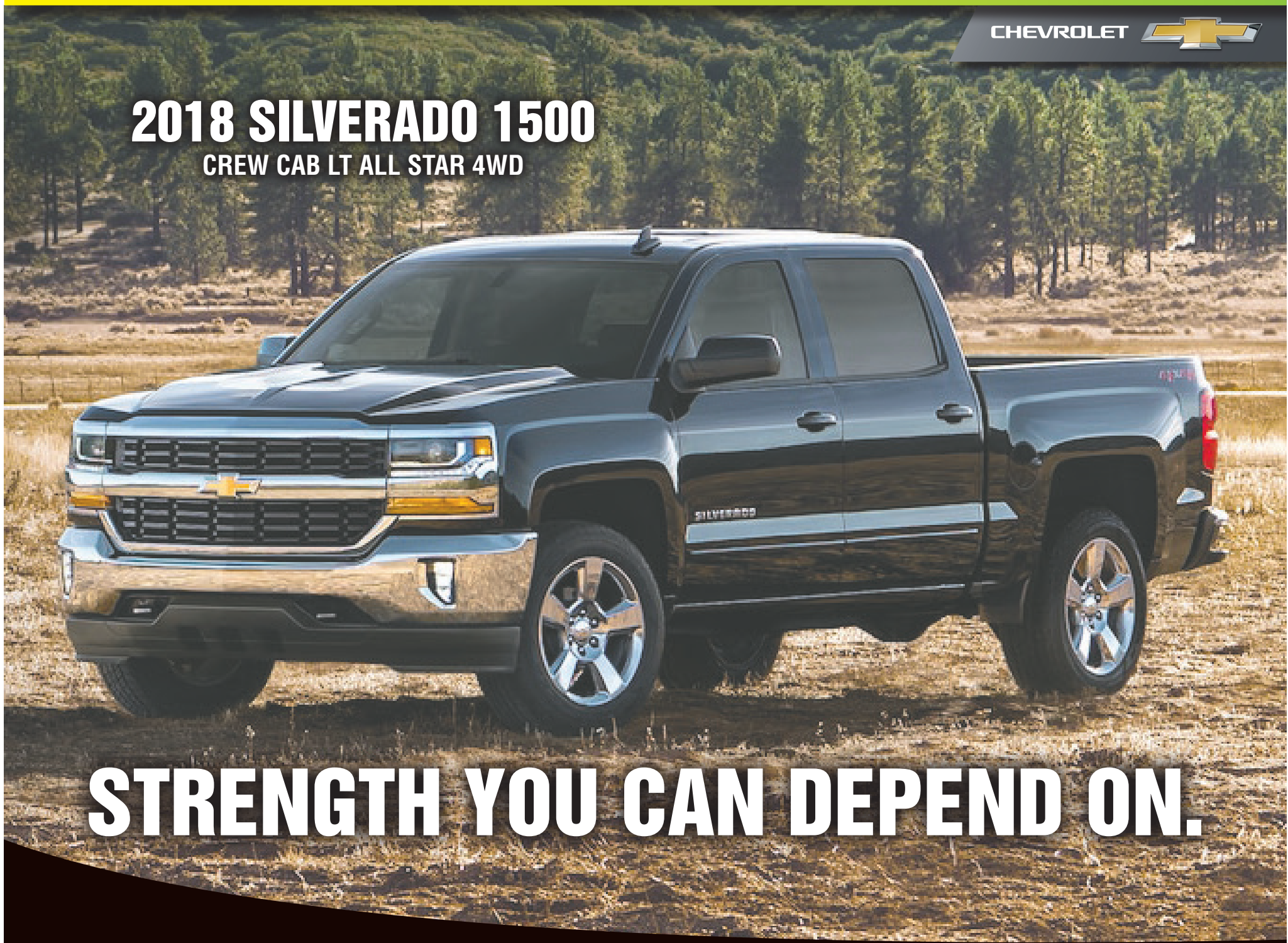
2018 SILVERADO 1500 CREW CAB LT ALL STAR 4WD