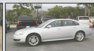
'16 CHEVROLET IMPALA $15,995