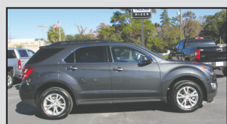
'17 CHEVROLET EQUINOX $21,995