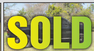
'11 CHEVROLET SILVERADO SOLD $21,995