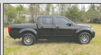
'15 NISSAN FRONTIER $19,995