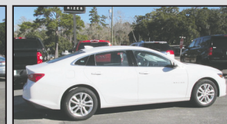
'17 CHEVROLET MALIBU $17,995