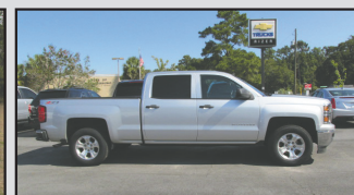
'14 CHEVROLET SILVERADO WAS - $28,995 NOW - $27,995