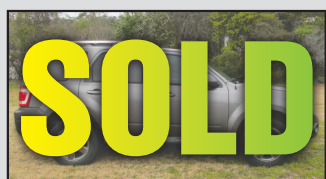
'09 FORD ESCAPE SOLD $6,995