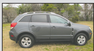
'08 SATURN VUE $7,995