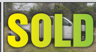
'11 GMC SIERRA SOLD $16,995