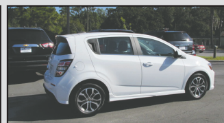
'17 CHEVROLET SONIC WAS - $17,995 NOW - $16,995