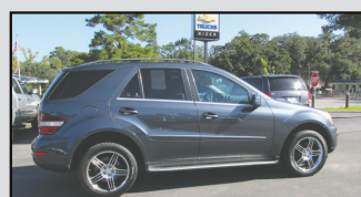
'11 MERCEDES 350ML $14,995