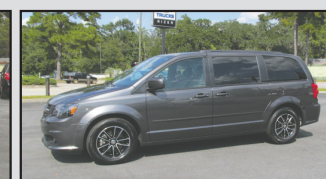
'17 DODGE CARAVAN WAS - $22,995 NOW - $21,995

351 N. Jefferies Blvd. • Walterboro, SC | 843-549-6363 | Parts - 843-549-6311 | Service - 843-549-6312