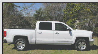
'16 CHEVROLET SILVERADO $23,995