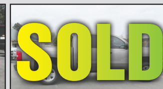
'12 CHEVROLET SILVERADO SOLD $22,995