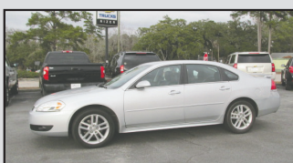
'16 CHEVROLET IMPALA