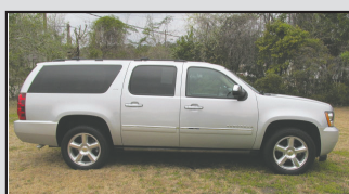
'13 CHEVROLET SUBURBAN