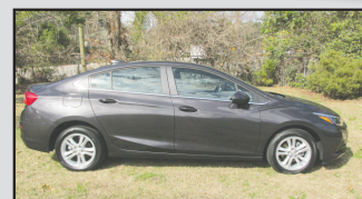
'17 CHEVROLET CRUZE