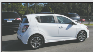
'17 CHEVROLET SONIC