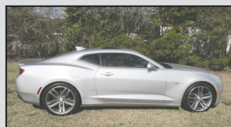
'17 CHEVROLET CAMARO