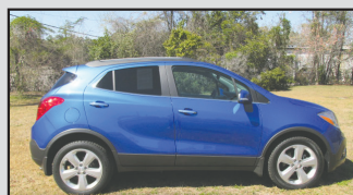
'16 BUICK ENCORE