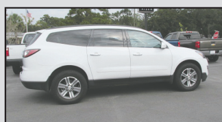
'17 CHEVROLET TRAVERSE