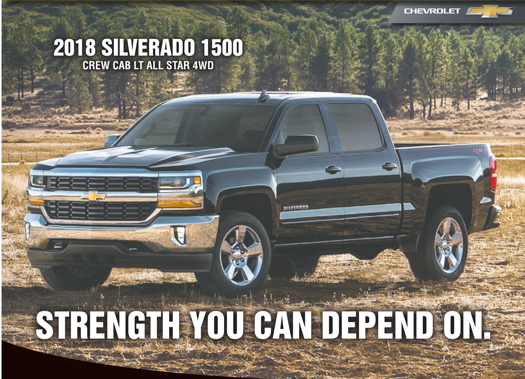
2018 SILVERADO 1500 CREW CAB LT ALL STAR 4WD