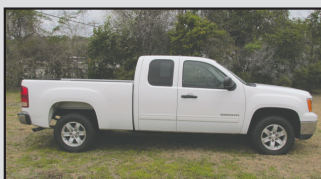
'11 GMC SIERRA