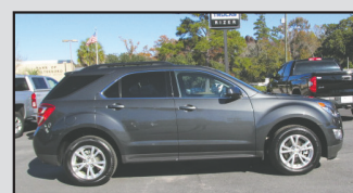
'17 CHEVROLET EQUINOX