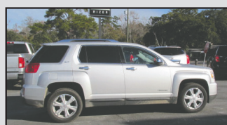
'17 GMC TERRAIN