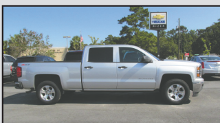
'14 CHEVROLET SILVERADO