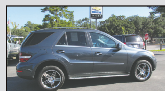
'11 MERCEDES 350ML