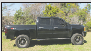
'11 CHEVROLET SILVERADO