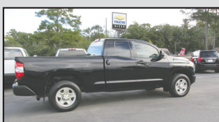
'17 TOYOTA TUNDRA