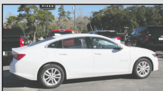
'17 CHEVROLET MALIBU