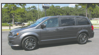
'17 DODGE CARAVAN