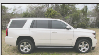
'15 CHEVROLET TAHOE