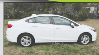
'17 CHEVROLET CRUZE