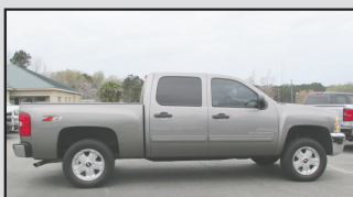
'12 CHEVROLET SILVERADO