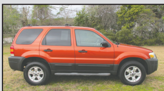
'07 FORD ESCAPE