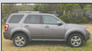
'09 FORD ESCAPE