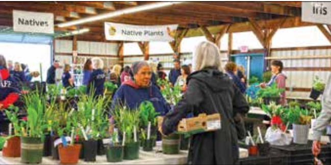
Photo from the 2024 plant sale.

Penn State Master Gardeners of Bucks County will hold its annual plant sale on Saturday, May 3, from 9 am to 1 pm at the Middletown Grange Fairgrounds located at 576 Penns Park Rd. in Newtown.