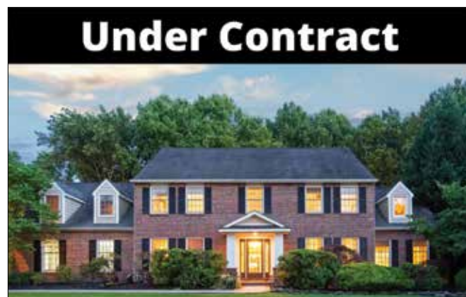
Current Holland listing under contract WAY ABOVE the highest neighborhood sale after 92 scheduled tours.

One of the primary drivers behind this robust market is our exceptional school districts—an important factor for many buyers currently planning for