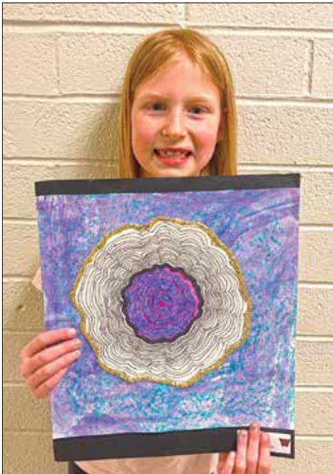
A third grader displays her 2D geode drawing featuring concentric shapes, contour lines, and a textured, pastel background.