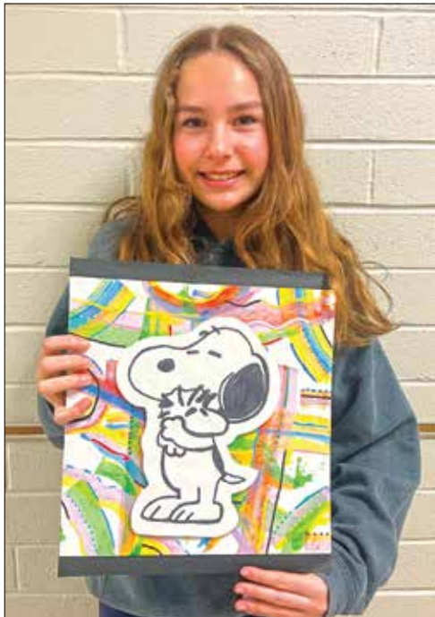
A sixth grader presents her pop art cartoon drawing created using a drawing grid, and an abstract painted background.