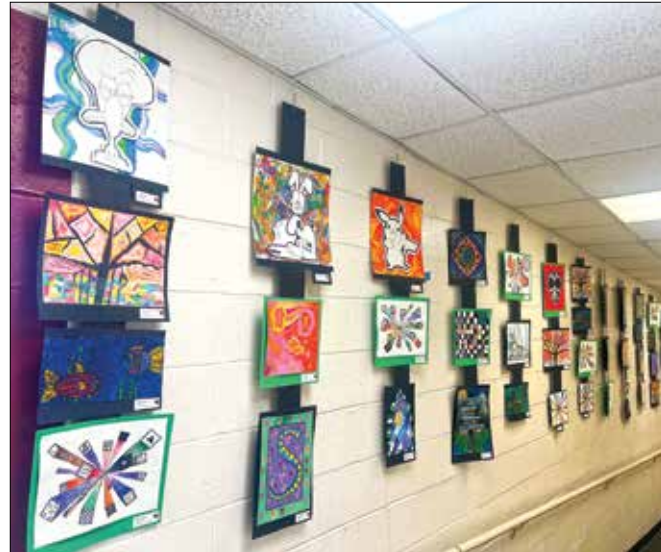
Artwork is displayed throughout the hallways at Warwick Elementary School.

The art curriculum at Warwick emphasizes both foundational and technical skills. “For grades 1–3, we focus on elements like color families, line, shape, and pattern. In upper grades, we get into things like one-point perspective and drawing with a grid to recreate cartoon characters