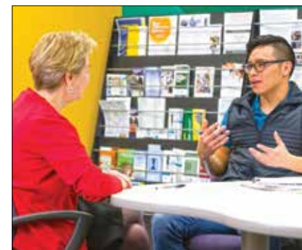
SCORE mentor meets with a client.

"SCORE is the most effective source of small business men-