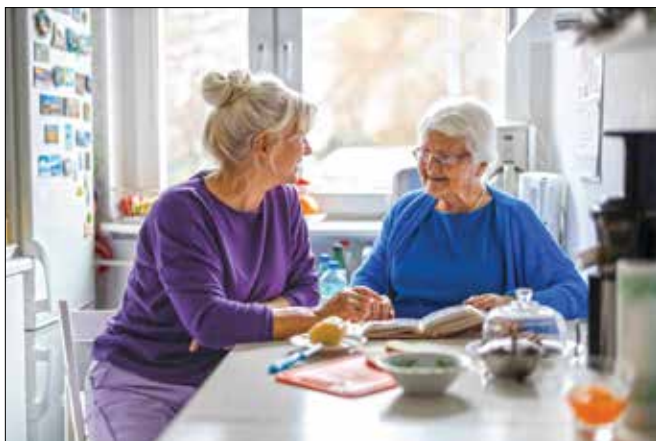
Now hiring senior caregivers for rewarding work. Apply today!

As a caregiver with Seniors Helping Seniors, you have the ability to balance work and homelife, work close to home based on your availability, and receive competitive compensation.