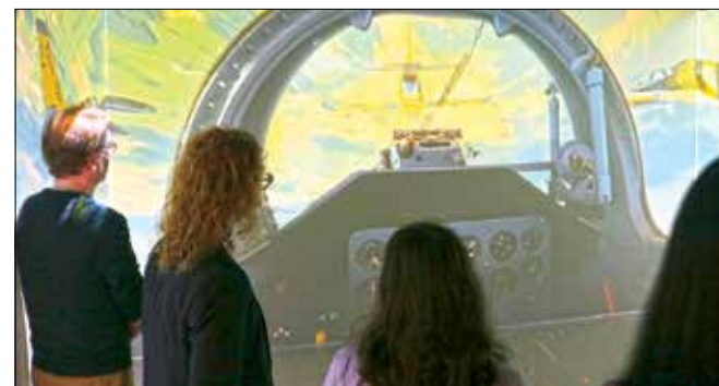
Participants enjoyed the experience of being a jet fighter pilot in the new Immersive Reality (IR) room at the Fab Lab Center."

The Fab Lab makes STEAM learning interactive, engaging, and hands-on. Through immersive experiences and cutting-edge tools, students develop creativity, collaboration, and problem-solving skills that prepare them for success. During the event, current and future partners experienced the Fab Lab's latest technology, including the new Immersive Reality (IR) room where they piloted a fighter jet, explored the ocean depths, and marveled at the northern lights. Others tested their skills flying drones—learning firsthand that