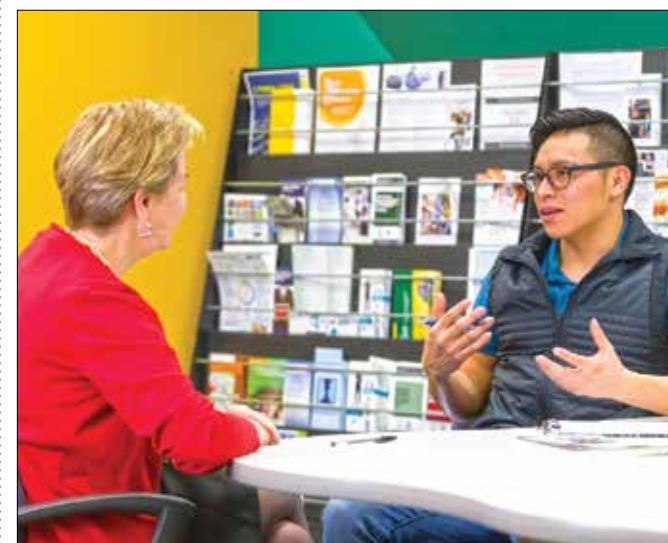
SCORE mentor meets with a client.

Visit www.score.org to learn more about local volunteer opportunities or to request a mentor for your small business.