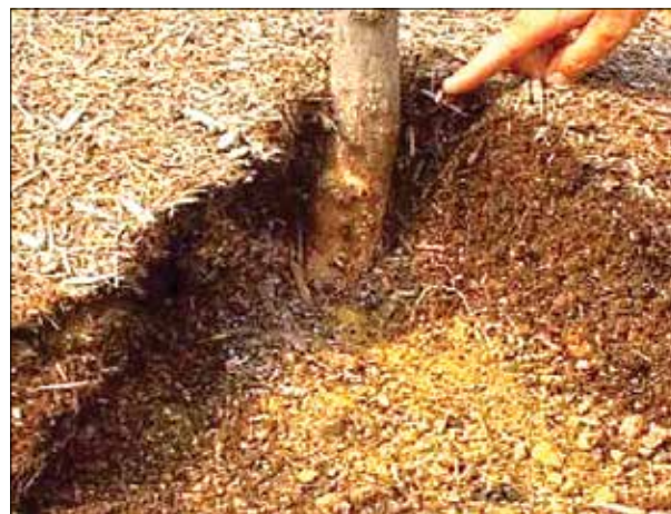
Be sure to use proper mulching techniques to keep your trees healthy.

Fertilize Thoughtfully: Assess your trees'