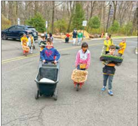
Nature Club participants are bringing wood chips, dirt, and seasonal flowers to the courtyard garden.

Thierolf arrived at Pine Road in 2003 and quickly took action. "I enjoy being outside; it ful-