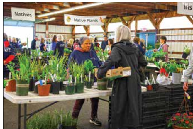
2024 plant sale.