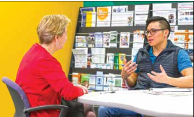
SCORE mentor meets with a client.

SCORE continued from pg. 21 making a positive difference right here in our local community.” SCORE data shows that entrepreneurs who receive three or more hours of mentoring report higher revenues and increased business growth. In addition, SCORE Bucks County offers a wealth of resources to