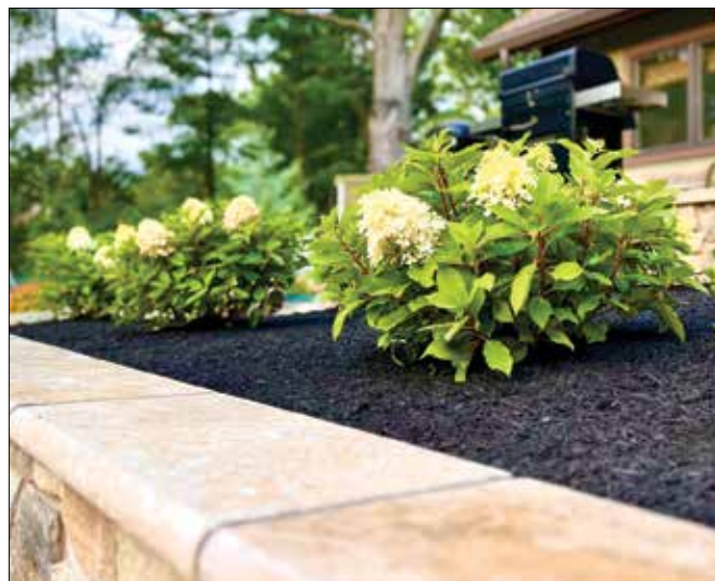
Choosing the correct materials defines the final outcome—beautiful!

A skilled designer will create a uniquely custom environment for your personal space, no matter the size! Through collaboration with a skilled designer, even the smallest of spaces can