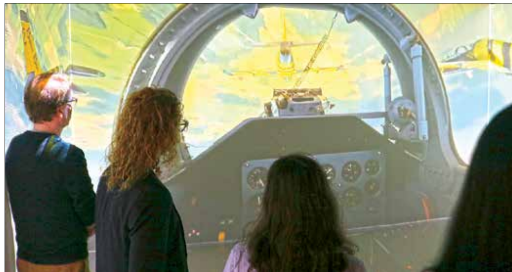
Participants enjoyed the experience of being a jet fighter pilot in the new Immersive Reality (IR) room at the Fab Lab Center.

This recent networking event marked the launch of the Fab Lab Corporate Partners Program, which creates opportunities for companies to invest directly in the Fab Lab