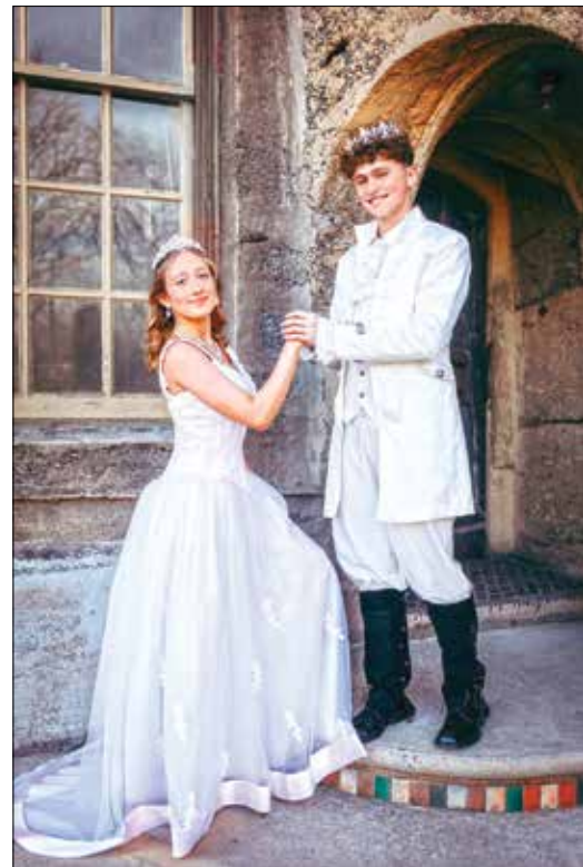
Ella, Stepsisters and Madame. Ella and Topher (Cinderella and the Prince).

parade at intermission as well as participate in photo opportunities with Cinderella's beautiful pumpkin carriage after the show. There will be two evening performances at 7 pm on May 2 and 3 and two