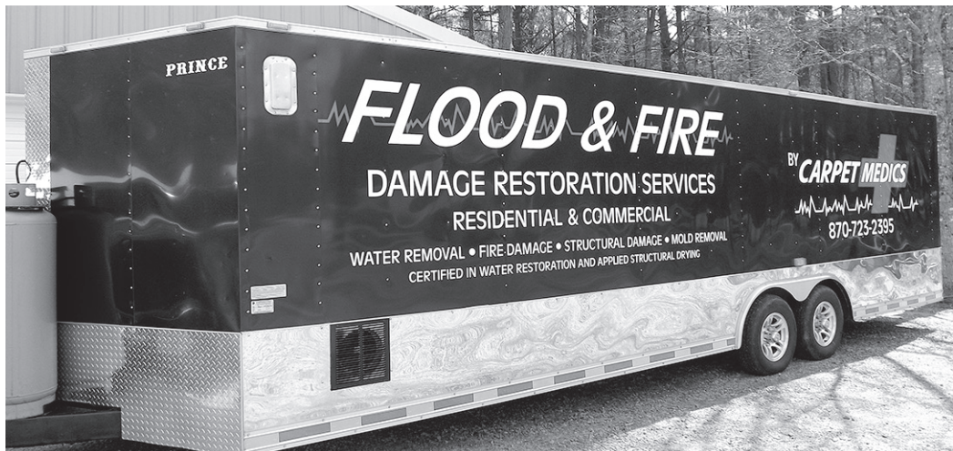
Special to the Advance Monticellonian

(Service Spotlight is a weekly advertisement highlighting local services. For information on how to advertise, call our advertising representatives at 367-5325.)