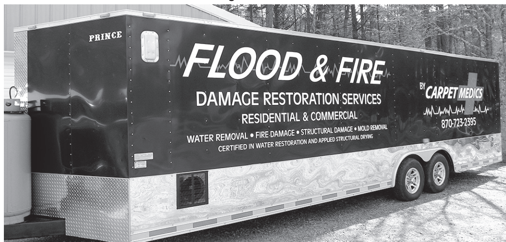
Special to the Advance Monticellonian

(Service Spotlight is a weekly advertisement highlighting local services. For information on how to advertise, call our advertising representatives at 367-5325.)