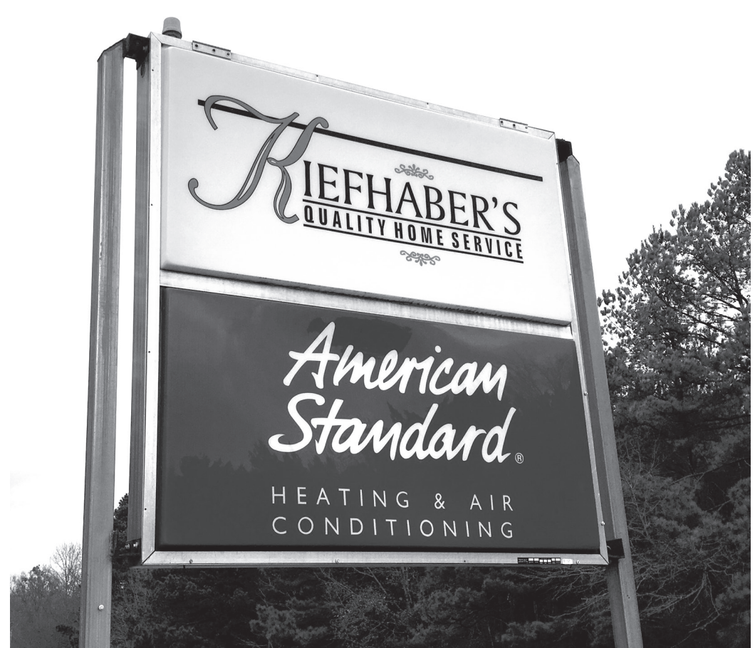
FOCUSED ON QUALITY. Pictured above is the Kiefhaber's sign. Kiefhaber's Heating and Air is located at 6236 State Highway 114 West in Star City, and Kiefhaber's Mobile Home Parts is located at 117 Greenfield Drive in Monticello.

(Service Spotlight is a weekly advertisement highlighting local services. For information on how to advertise, call our advertising representatives at 367-5325.)