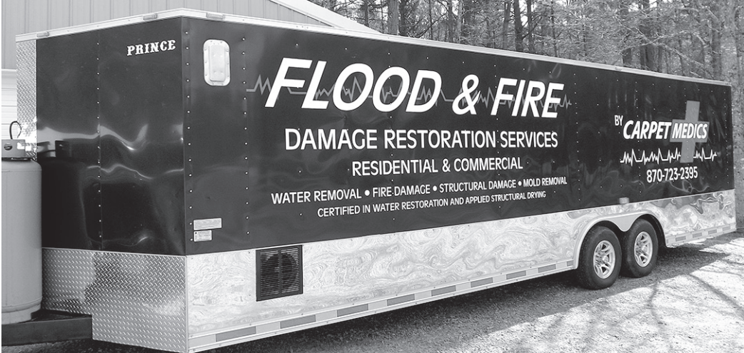
Special to the Advance Monticellonian

Carpet Medics brings their experience to work for you.