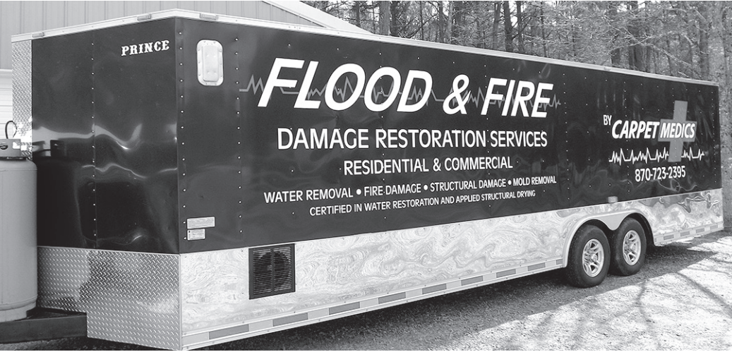
Special to the Advance Monticellonian

(Service Spotlight is a weekly advertisement highlighting local services. For information on how to advertise, call our advertising representatives at 367-5325.)