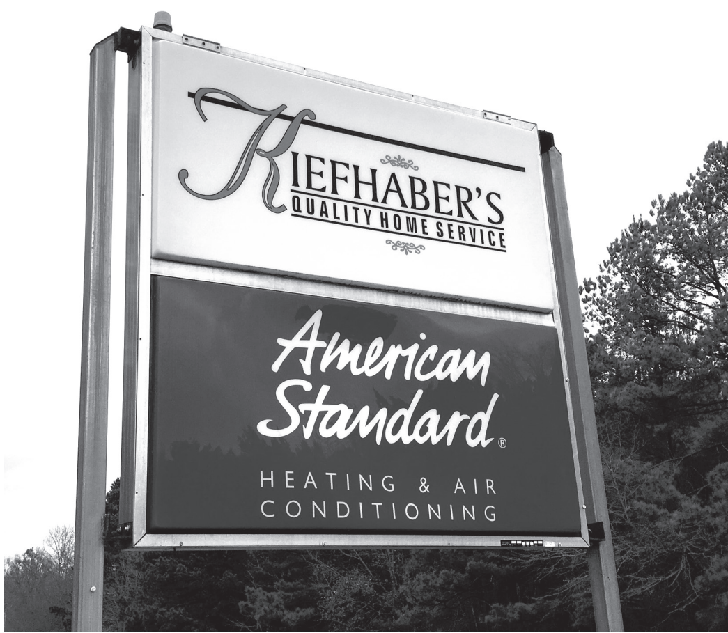
FOCUSED ON QUALITY. Pictured above is the Kiefhaber's sign. Kiefhaber's Heating and Air is located at 6236 State Highway 114 West in Star City, and Kiefhaber's Mobile Home Parts is located at 117 Greenfield Drive in Monticello.

(Service Spotlight is a weekly advertisement highlighting local services. For information on how to advertise, call our advertising representatives at 367-5325.)