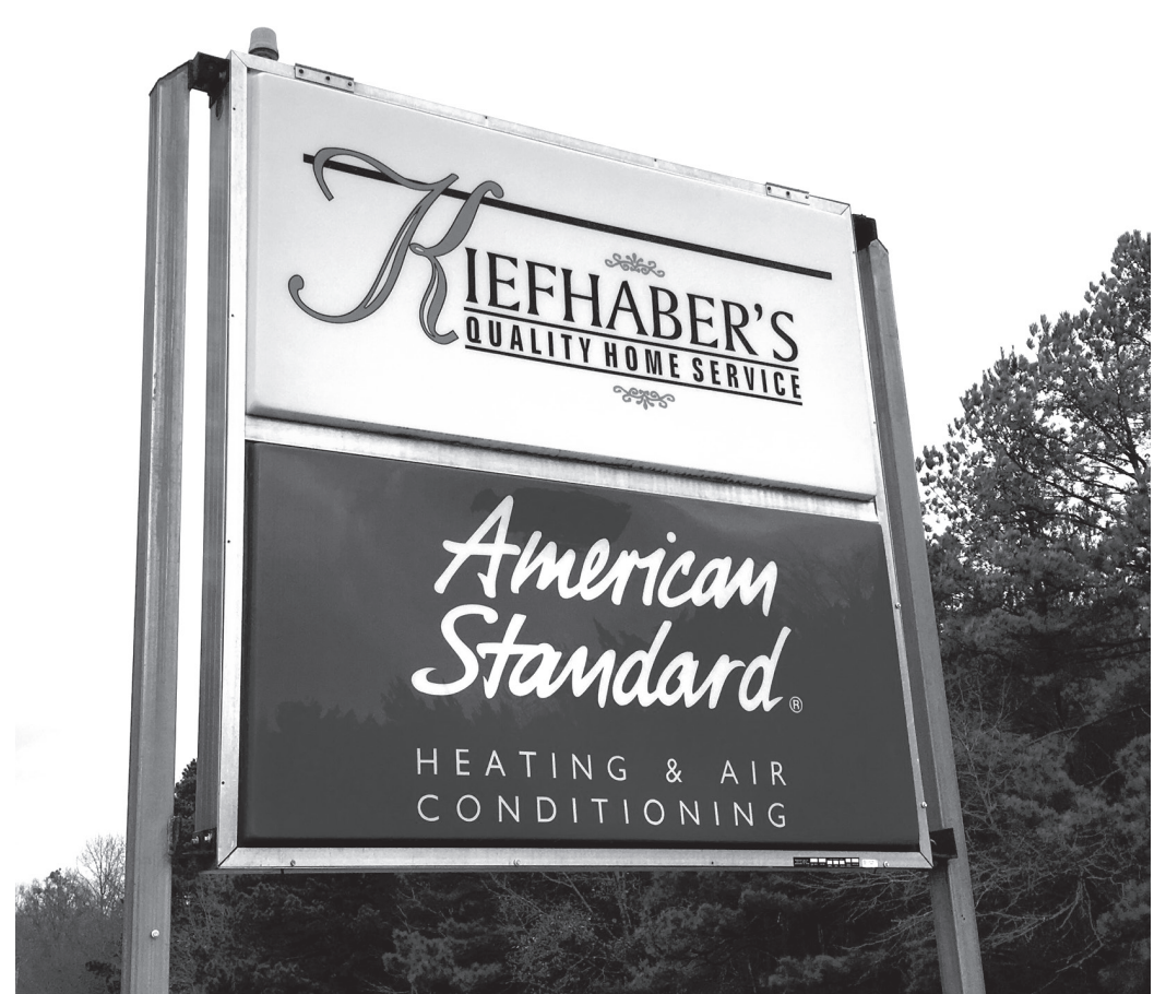
FOCUSED ON QUALITY. Pictured above is the Kiefhaber's sign. Kiefhaber's Heating and Air is located at 6236 State Highway 114 West in Star City, and Kiefhaber's Mobile Home Parts is located at 117 Greenfield Drive in Monticello.

(Service Spotlight is a weekly advertisement highlighting local services. For information on how to advertise, call our advertising representatives at 367-5325.)