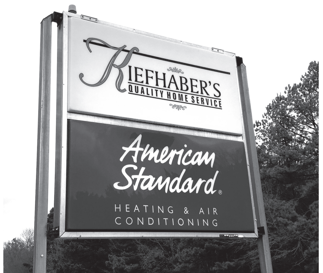
FOCUSED ON QUALITY. Pictured above is the Kiefhaber's sign. Kiefhaber's Heating and Air is located at 6236 State Highway 114 West in Star City, and Kiefhaber's Mobile Home Parts is located at 117 Greenfield Drive in Monticello.

(Service Spotlight is a weekly advertisement highlighting local services. For information on how to advertise, call our advertising representatives at 367-5325.)