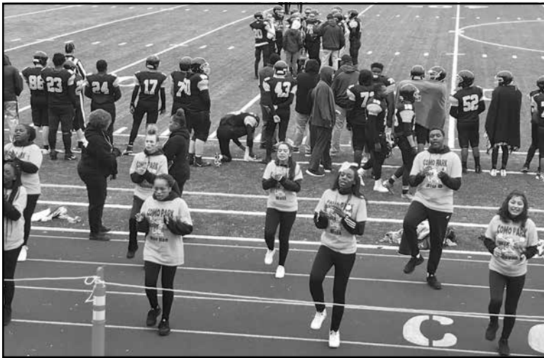
On Sat., Sept. 29, for the first time in school history, Como Park was able to host its homecoming football game—at home!