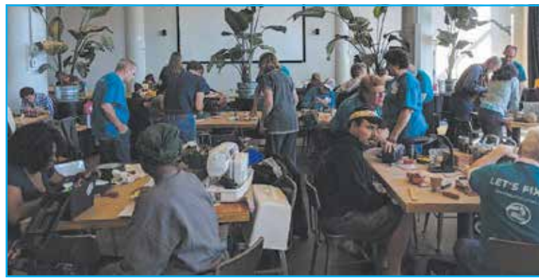
Mobile Menders was part of a Ramsey County Fix-It Clinic at Black Stack Brewing on Sept. 22. The next event will be at Galtier Community School to offer a Make Your Own Superhero Cape on Thursday evening, Oct. 25. (Photo submitted)

"Recycling is such a powerful word, and people can feel overwhelmed," observed Ooley. "Getting your clothes mended is a simple way to start."