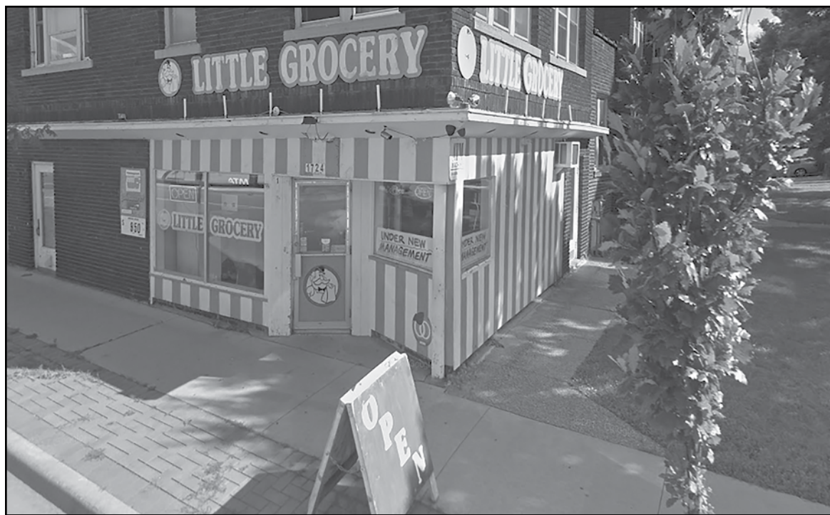
The Little Grocery, 1724 University Ave., has applied for a variance of 40' to become a "tobacco product shop" this fall. Tobacco products shops in St. Paul need to be at least one-half mile, or 2,640 feet apart. The Little Grocery is 40' short of the half-mile limit and have asked for a variance.

The ban was delayed to give stores time to sell out existing inventory. Convenience stores, grocery stores, and other retailers must stop selling the menthol-flavored