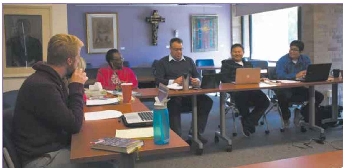
United Theological Seminary students in a typical class with examples of the school's theological art collection in the background. (Photo submitted)

Global Academy, a pre-K-8th grade International Baccalaureate Charter School, has purchased the seminary's former location in New Brighton.