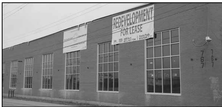
United Theological Seminary will be moving into the Towerside Innovation District and Creative Enterprise Zone in St. Paul.

“While much has been written about the diminishing perceived need for ‘church’ at the center of community life in modern society, the need for a spiri-