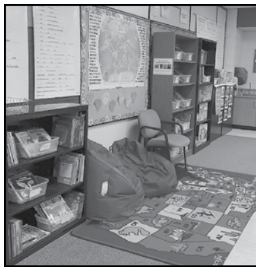
An inviting and comfortable space has been created for the volunteers and students in the Reading Partners program.