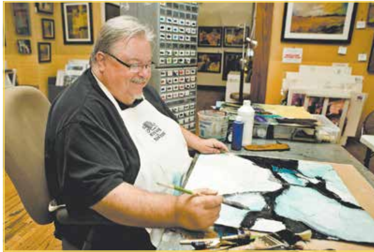
But the landscapes stopped holding his full attention a couple