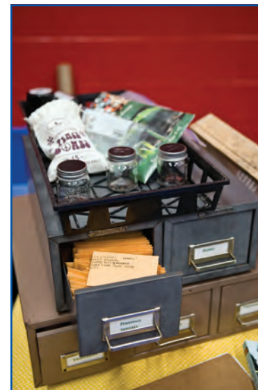
A portion of the mobile Como Community Seed Library, where gardeners can check out seeds to sow, grow, and share.