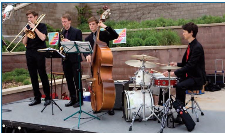
The Walker West Jazz Ensemble consists of one Highland and three Central High School students.