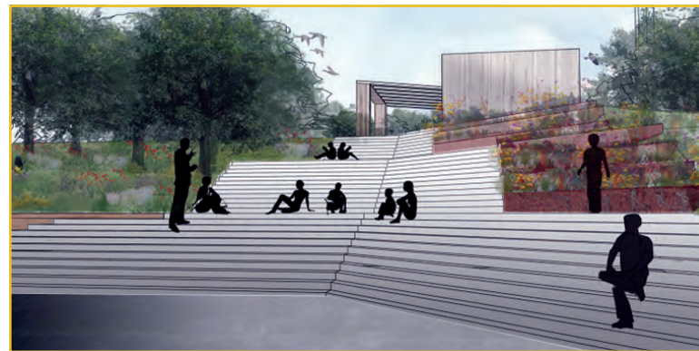
Although no final plan has been developed for the new park behind Gordon Park High School, students envision an amphitheater that would serve as an outdoor classroom and place to hold community concerts.

Students have referred to the park as Three Ring Gardens, while the city has labeled it Lexington Commons. Suggestions for the final name were collected from the community during a student-organized event on May 25 at the site, which is located between University and St. Anthony avenues. The event also