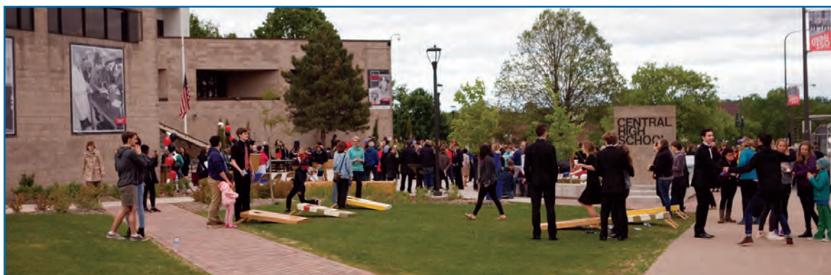
Photo above: The transformed plaza in front of Central High School with rock benches for seating, better lighting, and vastly improved storm water capture and filtering to benefit water quality. Major plaza funders include the Capitol Region Watershed District, the State of Minnesota, the Board of Water and Soil Resources, the Mardak, and the St. Paul Foundation.