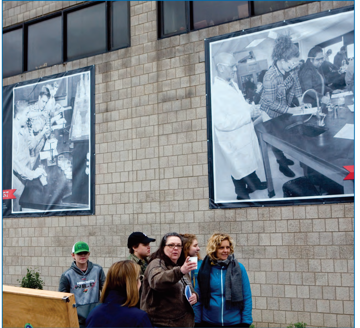
Two of the many banners from the Central Then and Now Project. At left, an industrial arts class from 1957. At right, an industrial arts class from 2017.