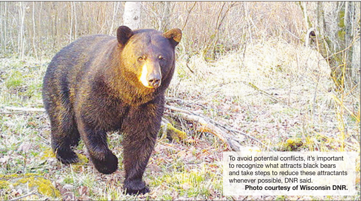
To avoid potential conflicts, it's important to recognize what attracts black bears and take steps to reduce these attractants whenever possible, DNR said.