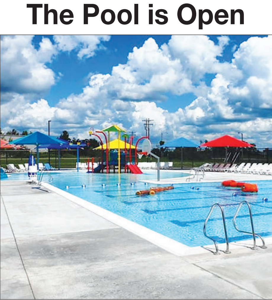
The Bierman Family Aquatic Center located at the Merrill Area Recreation Center opened for the summer season on Tuesday, June 3, 2025. Tot Time is offered in the morning (pre-registration required - Call 715.536.7313). Regular swim session runs 11:30 a.m. to 6:30 p.m. For more information and current pricing, go to the “Merrill Park and Recreation” Facebook page or call 715.536.7313. Children under age 10 must be accompanied by an adult.