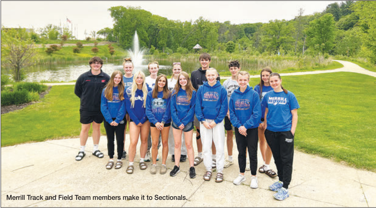
Merrill Track and Field Team members make it to Sectionals.

City Meet at Wausau East On Tuesday, May 13, Merrill athletes competed against