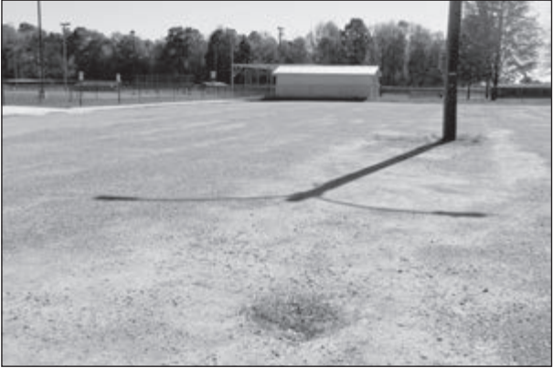
The asphalt parking lot at Bucholtz Park will be repaved in 2025, replacing the parking lot at the Clintonville Community Center on the city of Clintonville’s Capital Improvement Plan.