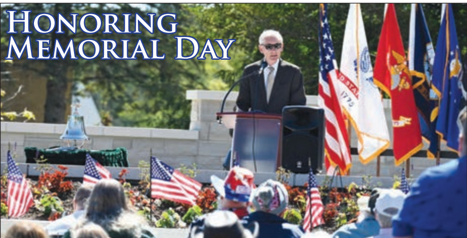
Governor Tony Evers spoke at the Memorial Day service at the Central Wisconsin Veterans Memorial Cemetery in King.

Specialty cruise announcements will be shared via social media. Tours can be booked online at www.clearwaterharbor.com , or by calling 715-258-2866.