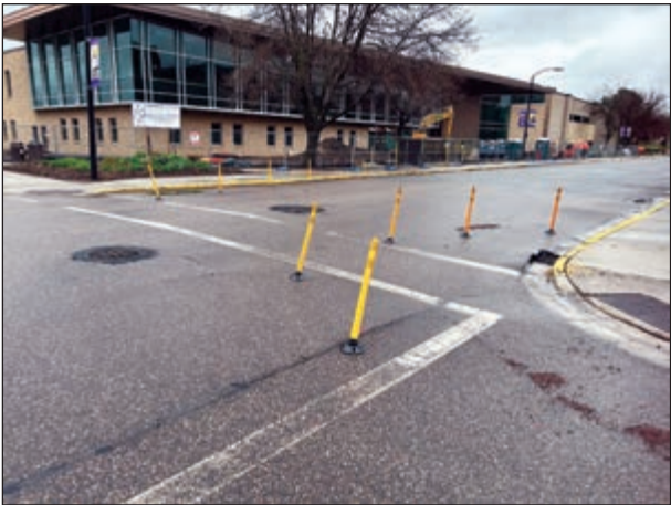
Curb extensions located on campus at Fourth and Isadore Street.

The current installations in Stevens Point are in a trial phase as the county gathers data and community feedback. The campus installa-