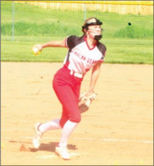
Hortonville Polar Bears get the Fox Valley Association victory.