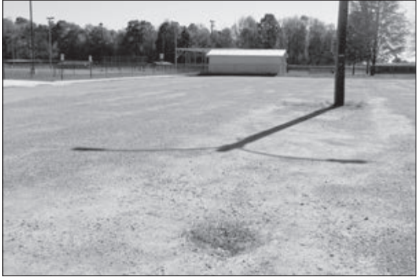
The asphalt parking lot at Bucholtz Park will be repaved in 2025, replacing the parking lot at the Clintonville Community Center on the city of Clintonville’s Capital Improvement Plan.