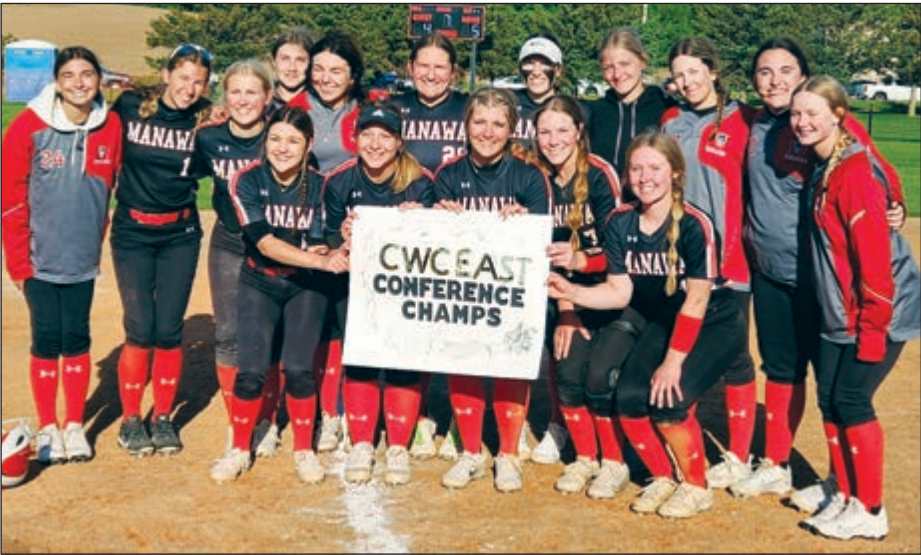
Manawa Wolves capture CWC-East championship on May 19.