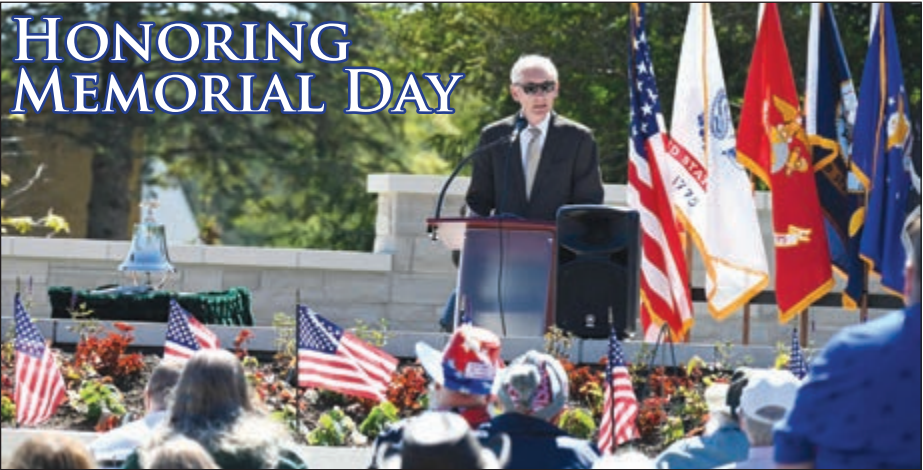
Governor Tony Evers spoke at the Memorial Day service at the Central Wisconsin Veterans Memorial Cemetery in King.

Specialty cruise announcements will be shared via social media. Tours can be booked online at www.clearwaterharbor.com, or by calling 715-258-2866.