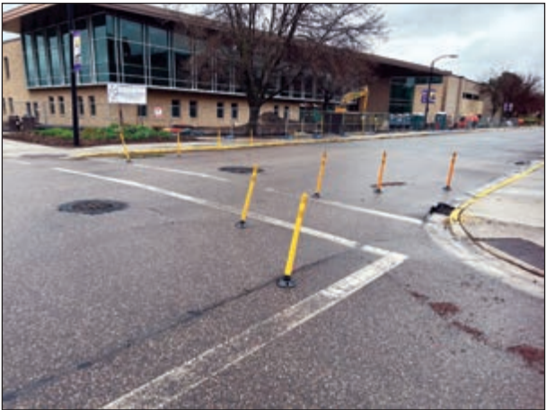
Curb extensions located on campus at Fourth and Isadore Street.