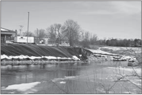
The shoreline stabilization began early spring at the Manawa dam site to ensure the northside of the river’s shoreline stops eroding into the river.

Once the permit was approved the timeframes nar-