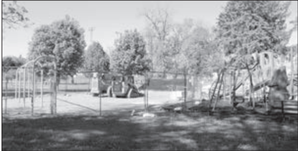
Work has begun on the all-inclusive park being added to W.A. Olen Park with the funds raised by the non-profit Down With Mylestones.

Hill said the all-inclusive park will be accessible for those in wheelchairs. Music notes will be located all around the park. There will be swings available for children with disabilities. Swings with a five-point harness and higher back will also be available for children who do not have the muscle tone or strength to support