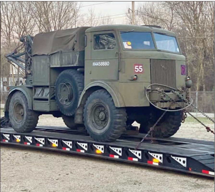
The FWD Seagrave Museum acquired a WWII artillery truck from the Netherlands that was built in Clintonville in 1945 by FWD (Four Wheel Drive) Corporation.