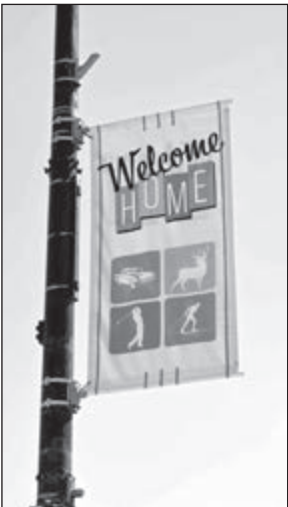
New Banners and trash cans have been added to Iola’s downtown area, soon to follow will be benches and flowers.